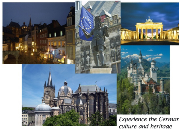
Experience the German culture and heritage